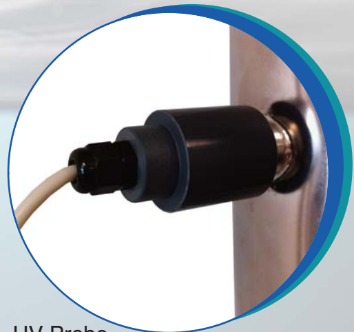
UV Probe Connects directly into UV Site Port.